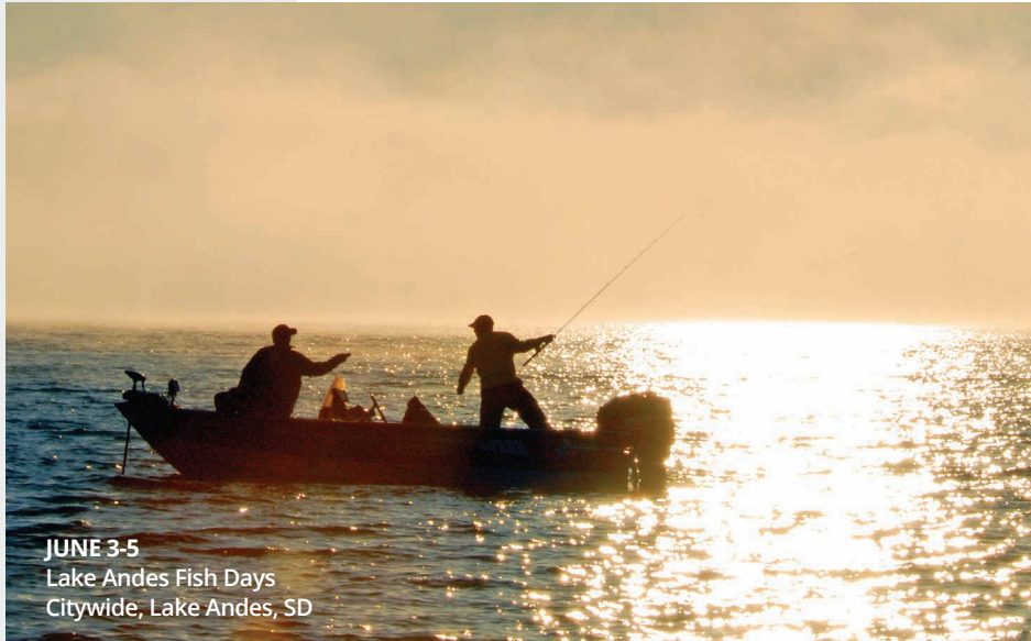
JUNE 3-5 Lake Andes Fish Days Citywide, Lake Andes, SD

To have your event listed on this page, send complete information, including date, event, place and contact to your local electric cooperative. Include your name, address and daytime telephone number. Information must be submitted at least eight weeks prior to your event. Please call ahead to confirm date, time and location of event.